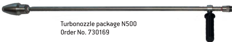
Turbonozzle package N500 Order No. 730169