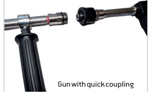
Gun with quick coupling