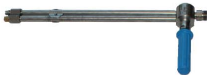
Double Lance N500 Order No. 730156