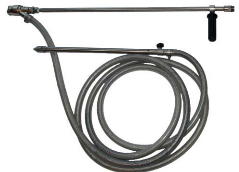
Sandblasting package N500, Order No. 730170