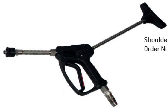
Shoulder Rest N500 Order No. 730162